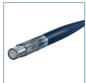
Ergonomic design for high comfort and control