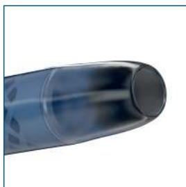
Tapered and robust tip for enhanced crossability